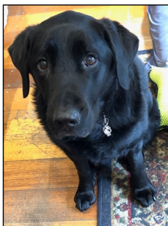
Wendra, those beautiful eyes!!! (Susana)