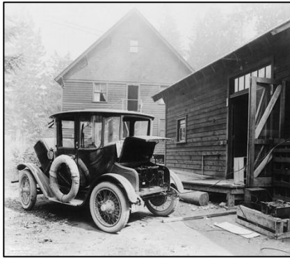
Charging an electric car in 1905